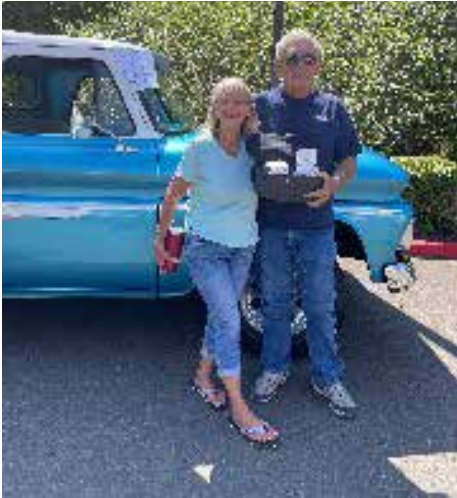
By Jim Wheat

The annual CPPC Picnic held at Sunnyside Memory Center on July 30 was a great success, the weather was perfect and we had 27 cars participating. Sunnyside went all out on providing the food, barbecue ribs, shrimp, hot dogs, drinks, snow cones among other great